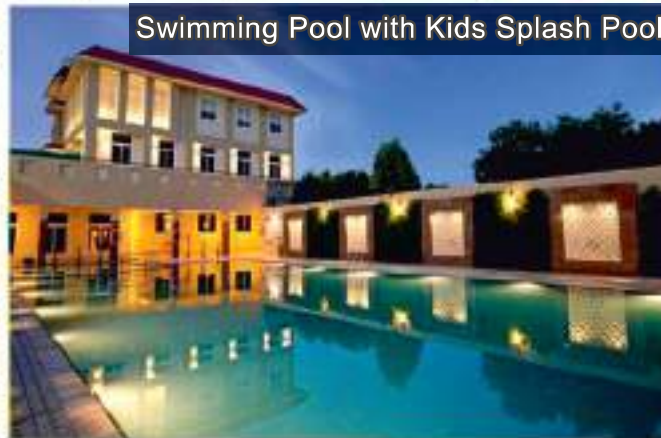
Swimming Pool with Kids Splash Pool