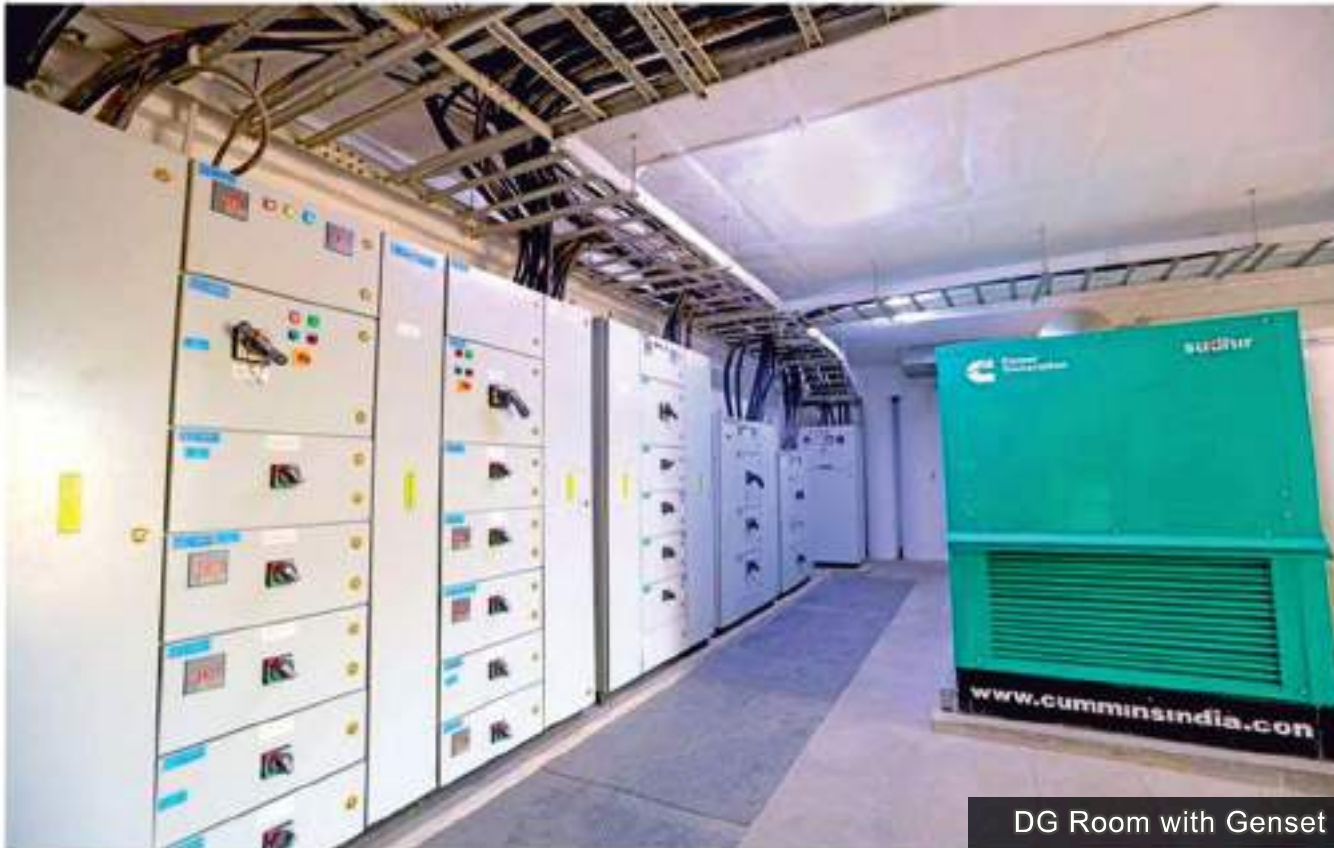
DG Room with Genset