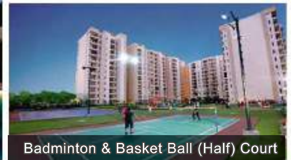
Badminton & Basket Ball (Half) Court