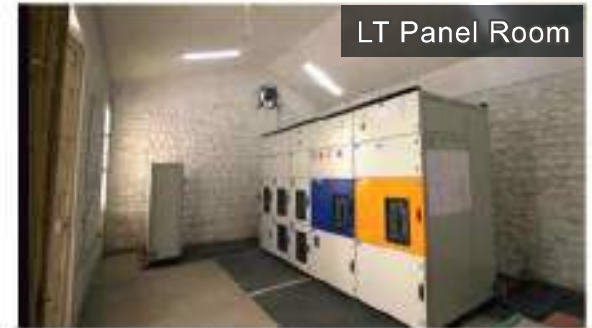
LT Panel Room